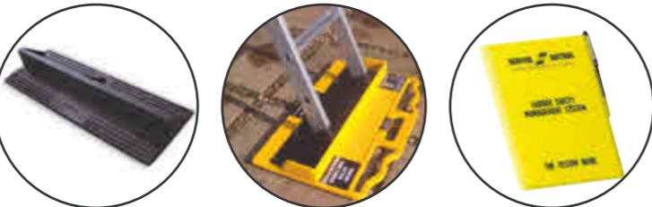
▶ LADDER PROTECTOR ▶ LADDA M8RIX PRO ▶ SAFETY RECORD BOOKS