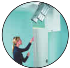
ALUMINIUM LOFT LADDERS

Please ask your local trade counter for more details