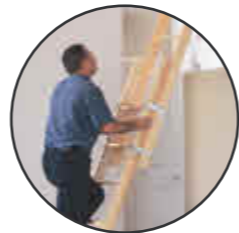
> TIMBER LOFT LADDERS