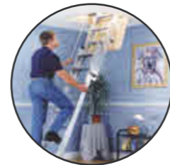
> DELUXE LOFT LADDERS