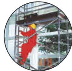
> SUMMIT INDUSTRIAL TOWER