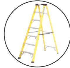
> SWINGBACK STEPS