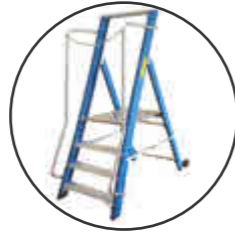
> MIDI WORK PLATFORM