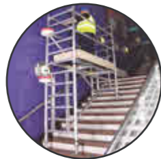
STAIR DECK TOWER

Please ask your local trade counter for more details