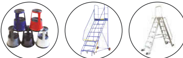
▶ KIK STEPS ▶ WAREHOUSE STEPS ▶ STOCK PICKING STEPS