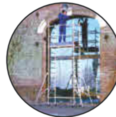
> HORIZON TRADE TOWER