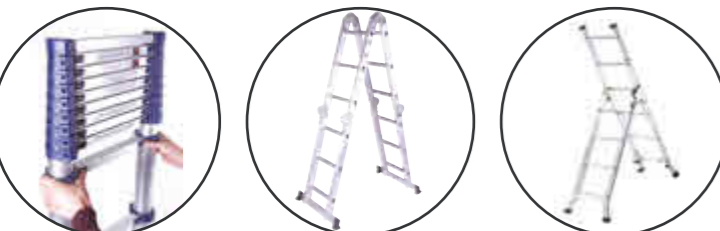
▶ TELESCOPIC LADDERS ▶ ADJUSTABLE LADDERS ▶ COMBINATION LADDERS