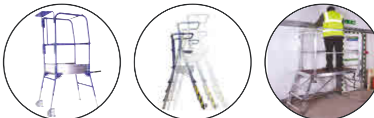
▶ MINI WORK PLATFORM ▶ MAXI WORK PLATFORM ▶ LOW LEVEL WORK PLATFORM

Please ask your local trade counter for more details