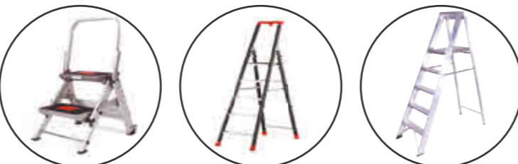
▶ LITTLE GIANT SAFETY STEP ▶ SUMMIT COMFORT STEP ▶ INDUSTRIAL PLATFORM STEPS