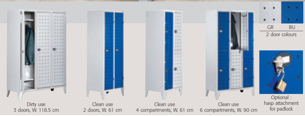
Dirty use 3 doors, W. 118.5 cm

D x H cm : 50 x 180. One piece sheet steel shells on raised feet in a light grey epoxy finish. Locks on each door. Designer doors in blue (BU) or light grey (GR). Multiple perforations. Label holder. Available in 3 versions : clean use industrial lockers, dirty use industrial lockers or multi-compartment lockers. Interior fittings : coat rail and upper storage shelf. Dirty use lockers are fitted with a central partition in addition. Optional : hasp attachment for padlock (padlock not supplied).