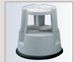
Duo step p. 150

W x D x H cm : 40 x 50 x 198. One piece sheet steel shell. Interior fittings : coat rail, shelf. Rear air vents (not visible from the front). 3 choices of finish : aluminium (AL), graphite grey (AN) or light grey (GR).