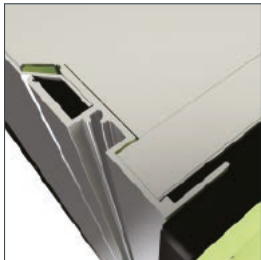
FLUSH FRAME FOR ZERO GAP