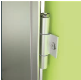
SELF CLOSING HINGE