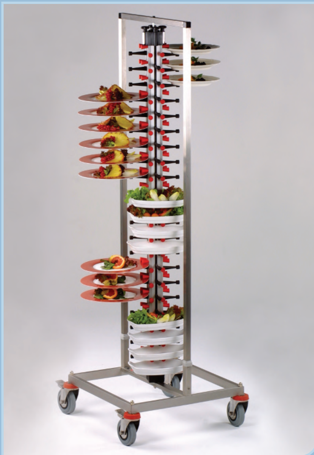
PLATE-MATE® BANQUETING TROLLEYS