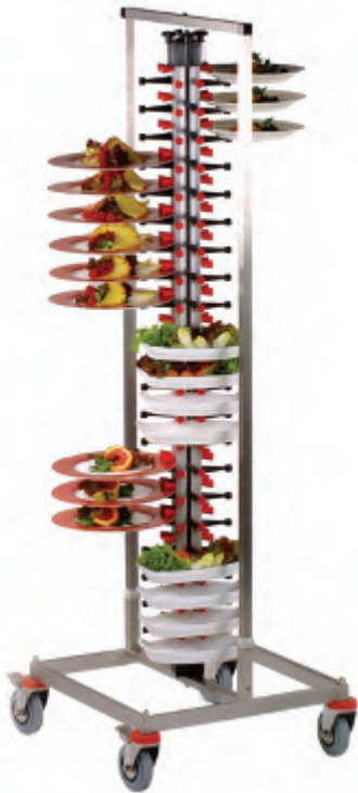
PLATE-MATE® 84 PLATE STANDARD BANQUETING TROLLEY