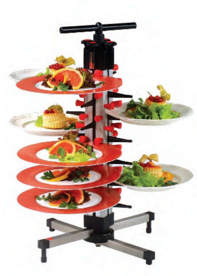
PLATE-MATE® TABLE-TOP UNIT

Free - standing units with a rotating centre column and handgrip for ease of movement.