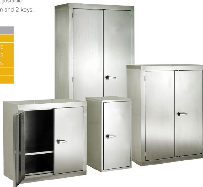
Stainless Steel Cabinets