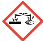
Acid Cabinet White RAL9003