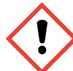
Coshh Cabinet L. Grey BS00A05