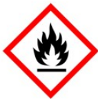
Flammable Cabinet D. Grey BS632 Yellow RAL1003