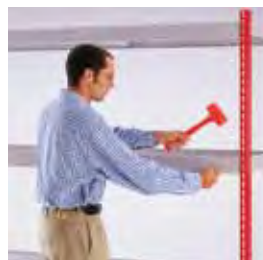
Unpack and assemble the framework by simply tapping together...