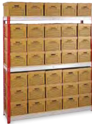
35 Box Bay