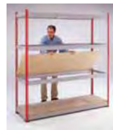
...with the framework complete, just drop the shelves into position.

EASY ORDERING - See back page for details