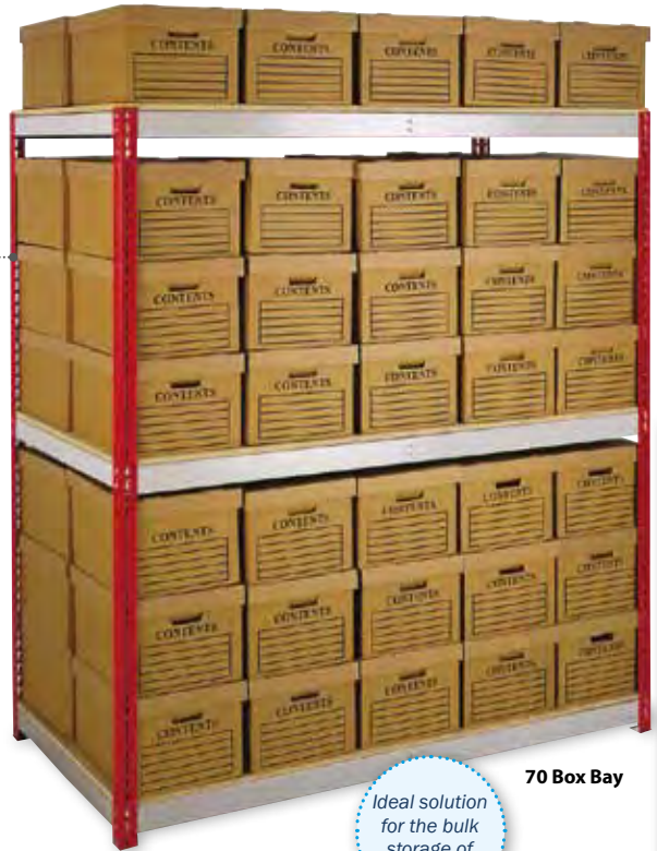
70 Box Bay

Ideal solution for the bulk storage of documents