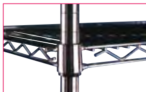
Fully adjustable shelves