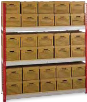
30 Box Bay

Easy to assemble shelving bays come complete with archive boxes