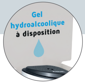
Neutral signage plate (can be personalised)