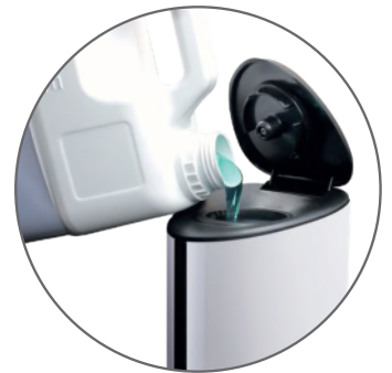
Large opening, easy and fast to refill