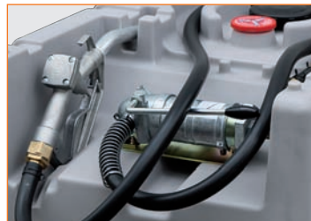
DT-Mobile Easy with hand pump and manual nozzle