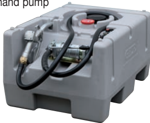
DT-Mobile Easy 200 l with electric pump 12V and automatic nozzle