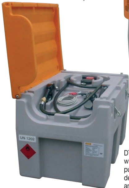
DT-Mobil Easy 200 l with flap lid