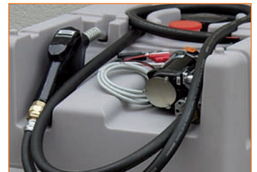
DT-Mobile Easy with electric pump 12V and automatic nozzle

Approved for transport for immediate consumption according to ADR 1.1.3.1 c). Fully assembled.