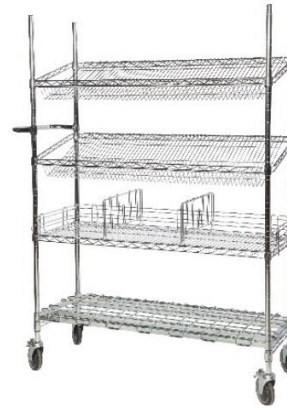
Type 4 (PT1836T4)