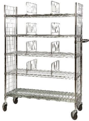
Type 1 (PT1848T1)