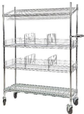
Type 3 (PT1848T3)