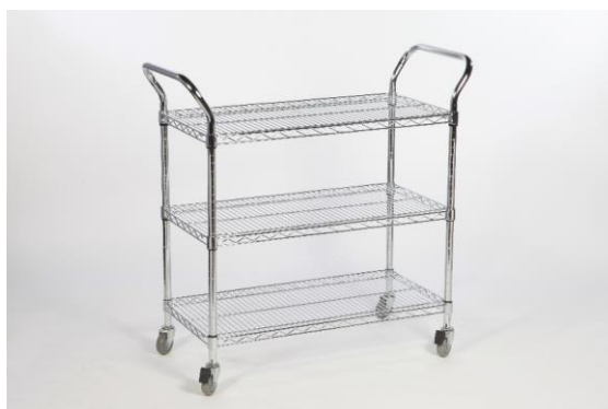
Example: 3 tier general purpose trolley