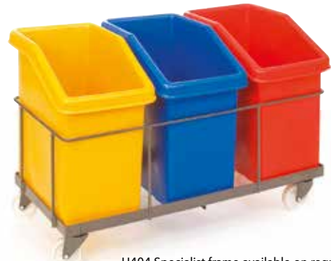
H404 Specialist frame available on request