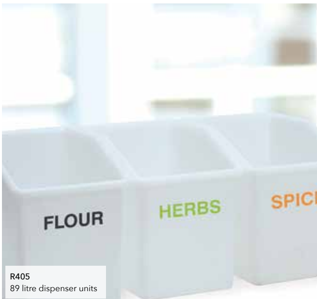
R405 89 litre dispenser units