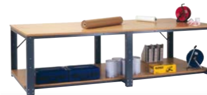
3000 x 1200 Starter workbench with MDF worktop and MDF base shelf Order code: KDB3028BSA