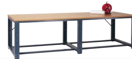
3000 x 1200 Starter workbench with MDF worktop Order code: KDB3028A