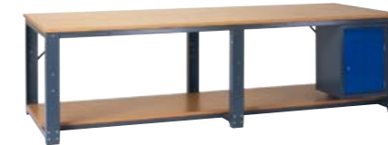
3000 x 1200 Starter workbench with MDF worktop, MDF base shelf and combined cabinet & drawer unit Order code: KDB3028BSA + CD1