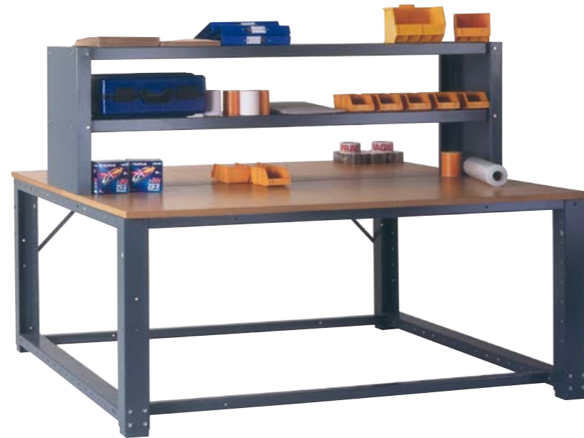
2000 x 1400 Starter workbench with MDF worktop & upper shelf unit Order code: KDB2048A + PICTURED ACCESSORIES USS235 2000mm Upper Shelf

Certain benches within the range are designed to accommodate two or more persons working together. With this in mind the upper shelf unit is accessible from both sides.