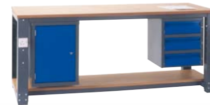
2000 x 700 Starter workbench with MDF worktop, MDF base shelf, cabinet, triple drawer & leg socket Order code: KDB2078BSA +C1 +D3 +LS1

ECONOMIC: This system offers great economic advantages over standard workbench sizes e.g. the 3000mm x 1200mm workbench (opposite) is the equivalent working area of 4 x 1500mm x 600mm workbenches.