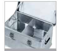
40864-40866 Adjustable aluminium divider set