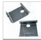
40834 Spring anti-opening feature