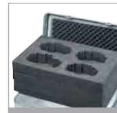
40735-40737 Pick 'n' Pluck foam set