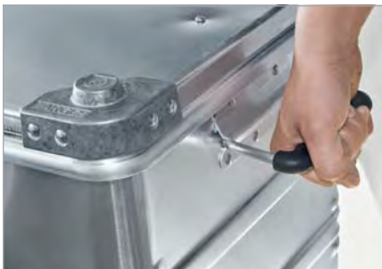
Ergonomically shaped, extra-wide ZARGES Comfort handles

Video for K 470 and other products available at Merlin Industrial Products