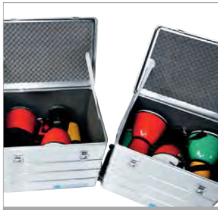
Universal protection, whatever the content