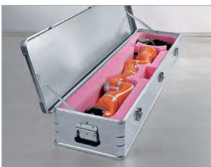
Antistatic foam insert