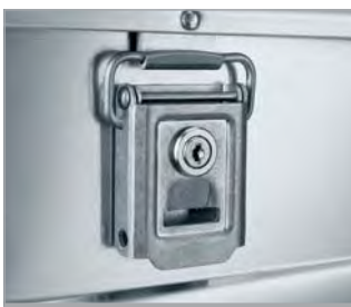
Fastener with plug lock

The ZARGES Comfort fasteners can be equipped with a mortise lock or with spring anti-opening feature. They can also be secured with a shackle lock or lead seal.