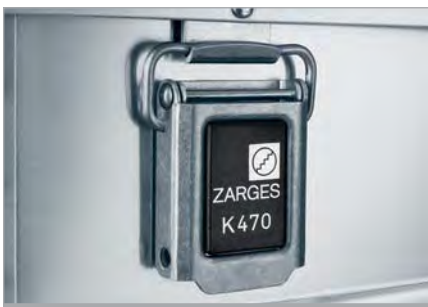
Durable ZARGES Comfort fastener