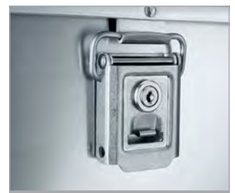
Fastener with spring anti-opening feature and plug lock