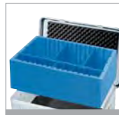
40730 Adjustable divider panel system 1