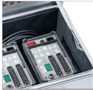
Wide variety of applications