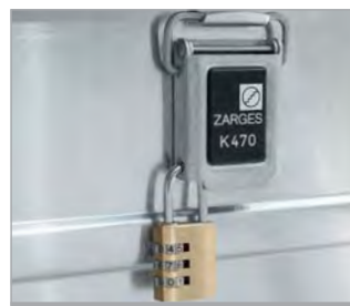
Fastener with K470 clip and shackle lock