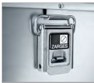
Fastener with spring anti-opening feature