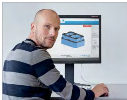
Use of 3D-data facilitates the design project