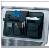
40626 Attaché insert