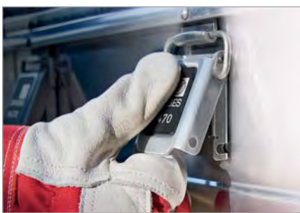
Perfect handling, even when wearing gloves

With 25 sizes, the K 470 series offers a unique selection of standard dimensions. Their capacity ranges from 13 l to 829 l.