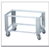
40680 W 152 dolly trolley