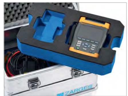
Foam inserts that fit perfectly