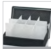
40731 Adjustable divider panel system 2