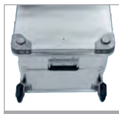
40738 Add-on castors