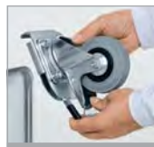
40741, 40742 Clip-on castors