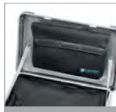
41820 Lid bag