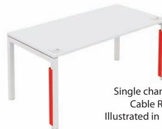
Single channel Cable Riser Illustrated in red.