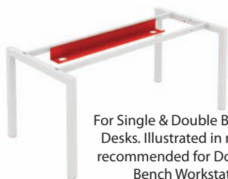
For Single & Double Bench Desks. Illustrated in red. 2 recommended for Double Bench Workstations.

Single channel Cable Riser (2 per pack).