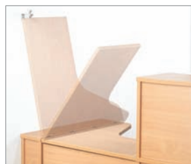
Lift-Up Hatch and Gate (See Note 2)

Note 2: When situated against a wall, the Lift-up Hatch and Gate unit must be firmly secured to wall. This is the customers responsibility and instructions will be left with the unit.