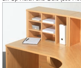
Pigeon Hole Option