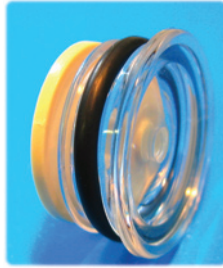
with reflector, size 22