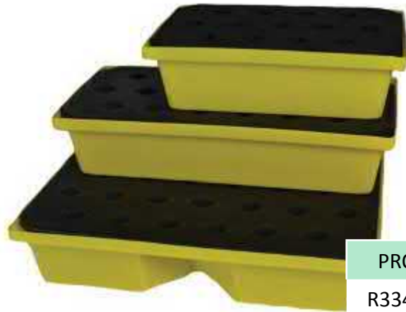
PRODUCT No R3340604 (20L) R3340603 (30L) R3340806 (40L)