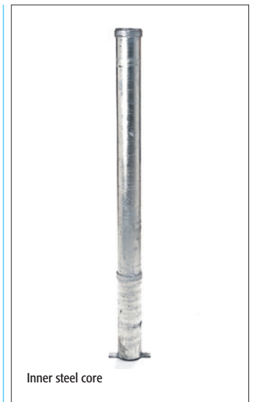
Inner steel core

Please note due to their specific purpose these bollards are for sub-surface installation only.