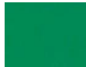
Light Green (Pan 3425C)