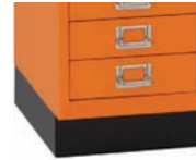
Optional Plinth Base