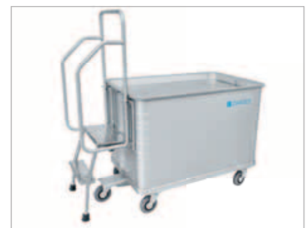
Storage and retrieval trolley, project-specific

Project-specific fabrication to meet your individual requirements.