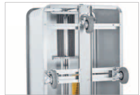
Replaceable lifting elements (Fig. 2)