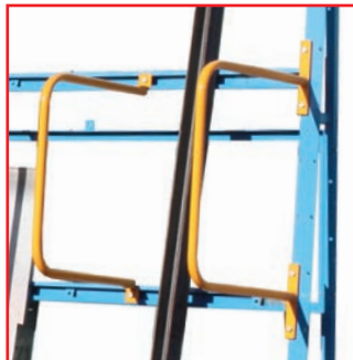
Movable dividers enable horizontal & vertical adjustment