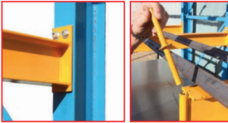
Heavy duty, height adjustable arms with removable end stops