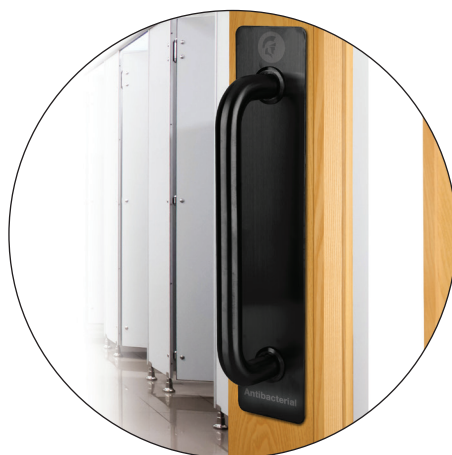
Stericore Pull Bar