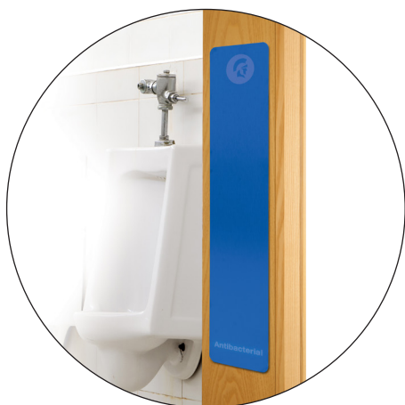
Stericore Finger Plate

Patent Protected. All test results and kill times available on request.