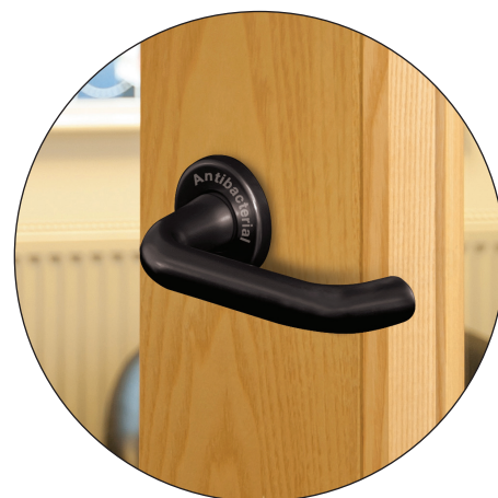
Stericore Lever Handle

60 minute fire rated - supplied in pairs