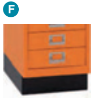
Optional Plinth Base