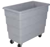
Casters (All versions)