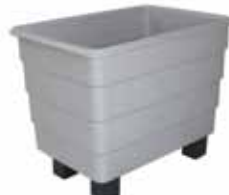
Pallet Feet (305L & 332L only)