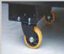
Wheel kit optional for all models