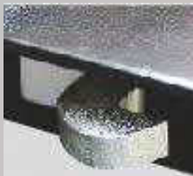
8mm thick hooks standard on all XLOCK models