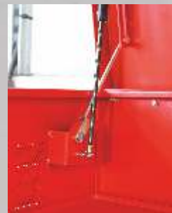
Mechanical lid stay (F442)

Compliant with all regulations for storage of chemical and flammable liquids/powders